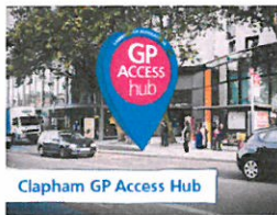
Clapham GP Access Hub

Bus numbers 2 & 88 stop outside the surgery. 77, 87 & 196 stops are a 5 min walk to the surgery