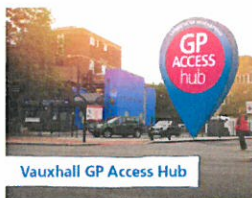
Vauxhall GP Access Hub

12noon–8pm Monday to Friday | 8am–8pm weekends and bank holidays